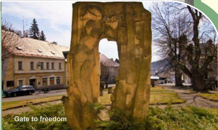
Gate to freedom