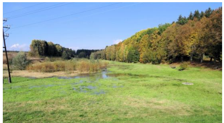
The retention basis