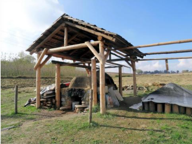
Reconstructed old glass furnace

work and his commitment to the Slavic culture in the Czech Republic are still known by a wide section of the population and recognized. The visit ended with a musical performance at the cultural center Ostrov Slovak singing group La Goiai.