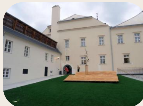
Garden at the old townhall