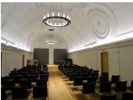
The old townhall after renovation