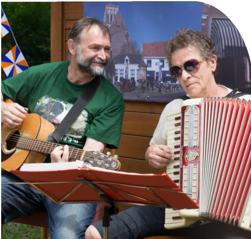
When Czechs and people from Brielle are together there is always music