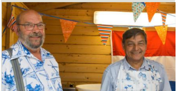
The bakers of “oliebollen”