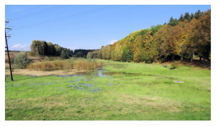
The retention basis

Then we go to the "Delta Works" from Havlíčkův Brod. Everybody who traveled to Havlíčkův Brod knows that the river Sázava flows trough the city. In Havlíčkův Brod the river Cihlarský Potok flows into the Sázava. This river rises north of Havlíčkův Brod. In this river we find about 12 lakes, including two in the Budoucnost park in Havlíčkův Brod (the park with the ice hockey stadium). In connection with the enhanced global warming Havlíčkův Brod must take measures. There is more rainfall, which can cause flooding along the Cihlarský Potok. To avoid flooding, the river was with EU support recent regulated in years. There was an embankment and achieved a retention basin (extra space for water). To make it attractive for recreational area an