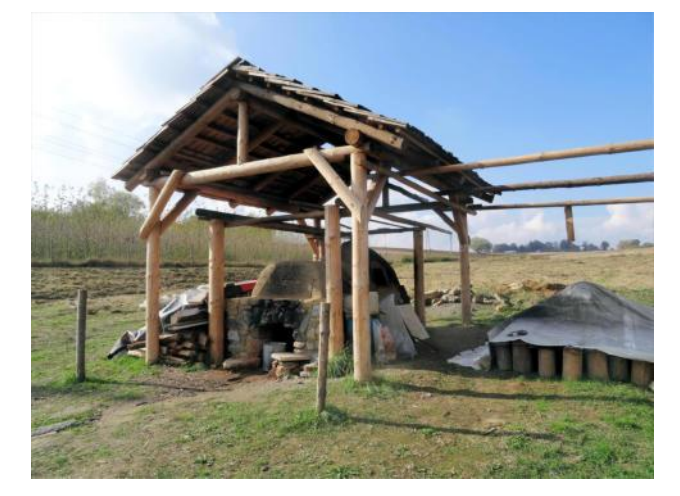
Reconstructed old glass furnace

ancient glass furnace was reconstructed at the retention basin, an old quarry turne into a picnic area and trails were constructed.