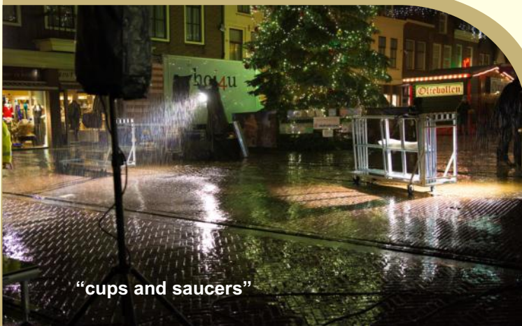
"cups and saucers"